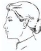
Royal Canadian Sea Cadet Dress Instructions