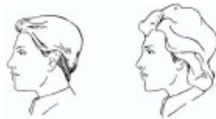
Royal Canadian Sea Cadet Dress Instructions